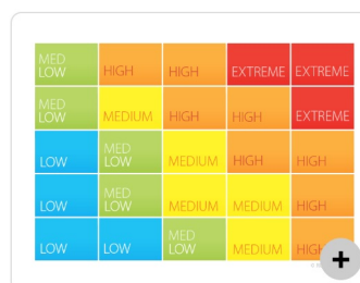
Risk based management of Issues and resources